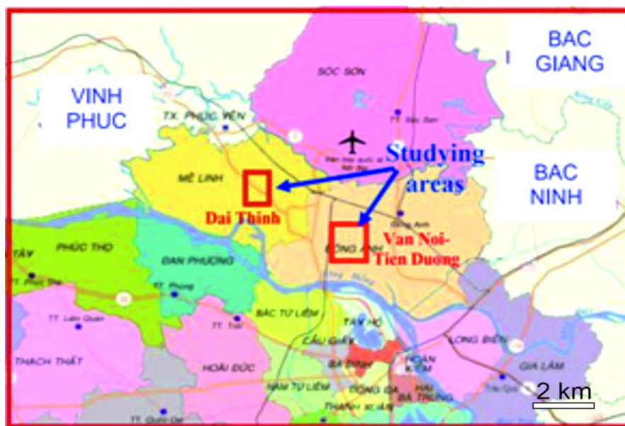
Figure 1. Location of studied areas.

The collected samples are processed as follows: soil is dissolved by distilled water, using a 0.1 mm sieve to separate soil grains into two batches: (1) the coarse-grained batch (>0.1 mm) collected to determine mineralogical composition under the stereo-optical microscope and (2) the fine batch (<0.1 mm) was dried before sending to analyze the mineral and chemical composition.