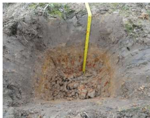
Figure 2. Typical soil profiles in Van Noi and Dai Thinh areas.

(a) Imperial gray soil developed on the sediments of the Vinh Phuc Formation in the Dam Village, Van Noi (Dong Anh); (b) Imperial gray soil developed on the sediments of the Vinh Phuc Formation in the Noi Dong Village, Dai Thinh (Me Linh).